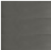
OPO transparent varnished