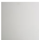
OP71 matt white