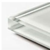
extra clear oyster