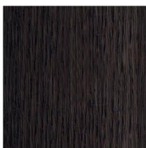
Tobacco stained ash