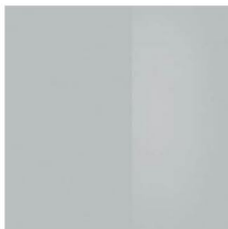
Bright stainless steel "supermirror"