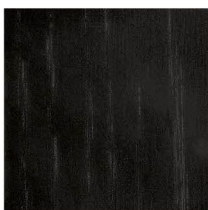
Black stained open pore ash