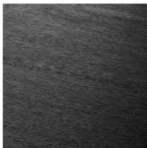
Black brushed aluminium